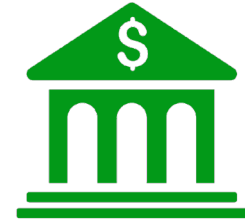
Financial & Insurance Offices